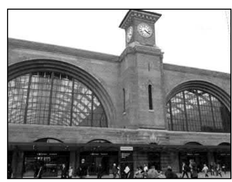
finishing times than rosters indicate, etc., etc. Is there a special school for this?... [Workers' Platform King's Cross 13/12/17]

Every time we think Virgin East Coast can't possibly do worse, they surprise us. The latest is them managing to forget staff on the roster, giving us totally different start or