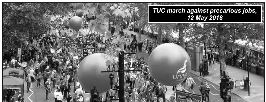
TUC march against precarious jobs, 12 May 2018

a foretaste of what the bosses have in store for the working class. Once they can conveniently ignore even the little protection offered by EU regulations, they will try to turn the screw even further, under the pretext that