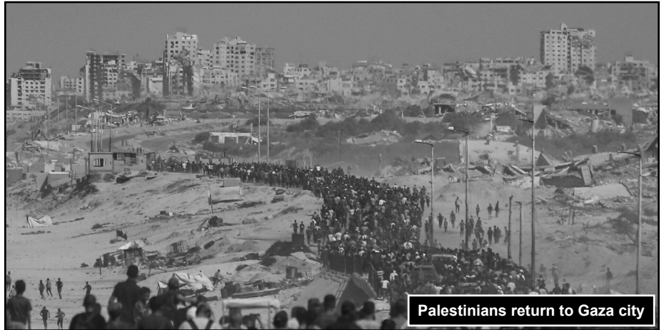
Palestinians return to Gaza city

But as has been the case from day one, the only hope for the people of the region lies in the organisational capacity