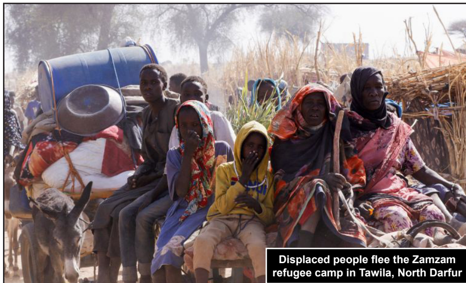
Displaced people flee the Zamzam refugee camp in Tawila, North Darfur

Today's civil war is little more than a vicious fight between these rival "warlords" over control of Sudan's resources: gold mines, oil, rare earths - which is also why each side has its own regional backers who want a share of the loot. Egypt has always supported the SAF. Saudi Arabia is also supporting the SAF, but the UAE, usually Saudi's ally, supports the RSF, supplying it with sophisticated weapons