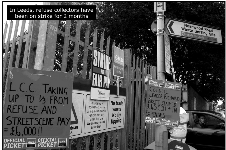
In Leeds, refuse collectors have been on strike for 2 months

These cuts are due to job re-evaluation under Labour's Equal Pay act - which was meant to end the discrimination against low-paid, mostly women workers such as school cooks, teaching and library assistants. But as the government did not back this up with the necessary funding, many councils have chosen to downgrade other workers' pay - especially those of bin collectors, where they have not been contracted out.