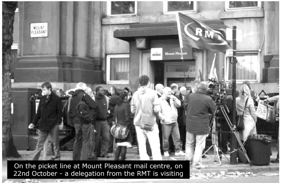
On the picket line at Mount Pleasant mail centre, on 22nd October - a delegation from the RMT is visiting

Talks are supposed to carry on between Royal Mail and the CWU, involving an ACAS arbitrator. But so what? How is that going to force Royal Mail into reversing its vicious attacks of the past months? Since the CWU has effectively agreed