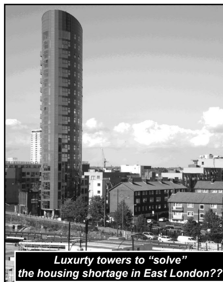
Luxury towers to "solve" the housing shortage in East London??

The real problem, of course, is the drastic shortage of affordable housing, which allows private landlords to make a killing out of huge rents. But then why not cap private rents, or start an "emergency" programme to build the social housing which is so desperately needed? That would cut much of the need for housing benefit. But this government is not about stopping landlords from lining their pockets! ☐