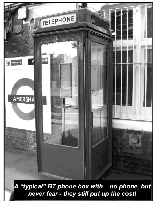
A "typical" BT phone box with... no phone, but never fear - they still put up the cost!