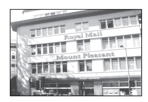
jobs? Especially when there are so many part-timers here who need full-time? Absolutely not! [Workers' Fight Mount Pleasant 23/01/12]

So now management is offering EVR - and they want replies back by 1 February - in just over a week. What will this mean? Anything between 30-50 or so more full-time job cuts! And what about the 75% full-time to 25% part-time ratio which was part of the 3-year 2010 Beyond Belief Agreement? Of course, it was never ever stuck to by RM bosses and now they're jumping the gun by cutting yet more full-timers - before this so-called "agreement" has even expired! Should we let them cut more full-time