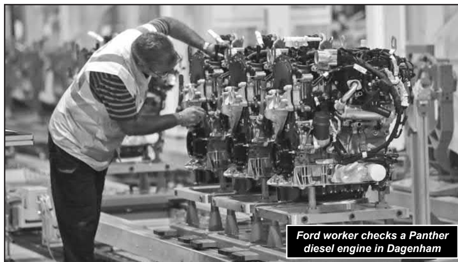
Ford worker checks a Panther diesel engine in Dagenham

threaten to do so, if Brexit brings in border checks. The ongoing crisis and its social devastation are taking