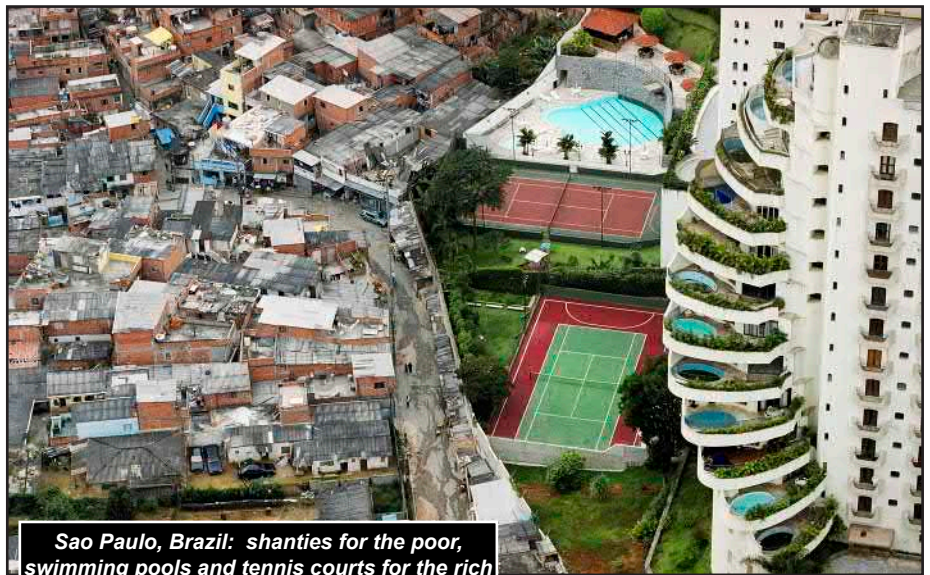
Sao Paulo, Brazil: shanties for the poor, swimming pools and tennis courts for the rich

where does it all come from? The report explains that over 2,000 simply inherited it or got it from "asset transfers". But that cannot be the whole story. In fact behind this all-time historical record is the real "record" - the gross increase in the exploitation of the world's working class. But this is hard to measure.