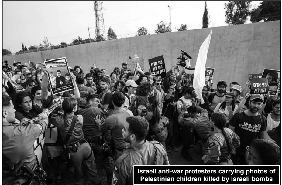
Israeli anti-war protesters carrying photos of Palestinian children killed by Israeli bombs

Only now, when more than 61,700 mainly civilians have been killed and when famine is spreading, have Western leaders issued a few words of "caution" to the Israeli terror state. Starmer, President Macron and Canada's Carney have urged Netanyahu to stop military operations and allow humanitarian aid into the Strip, saying that "the level of