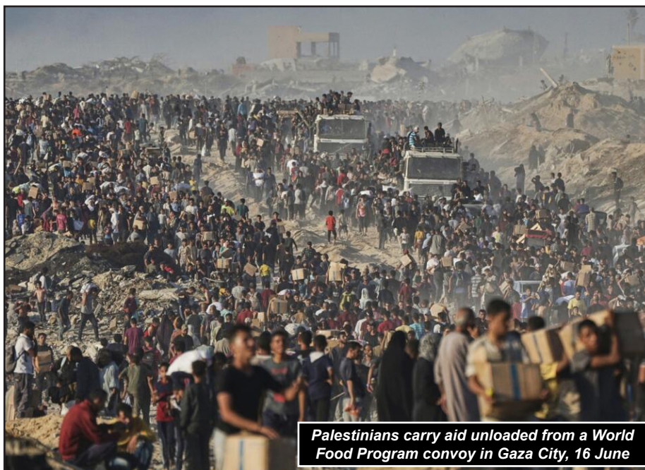
Palestinians carry aid unloaded from a World Food Program convoy in Gaza City, 16 June

Netanyahu and defence minister Katz then accused Haaretz of "blood libel". The military operation at these sites is known as "Operation Salted Fish" - the Israeli version of the children's game "red light, green light" - a sadistic joke at the