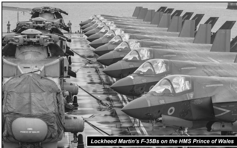
Lockheed Martin's F-35Bs on the HMS Prince of Wales

Let's not forget that NATO is the military alliance of western European countries under US command, which, in 1949, aimed to prepare for war against the Soviet Union. Today, it supports US global military, industrial, and political interests throughout Europe and beyond. As such, the US focus during the Summit on weapon