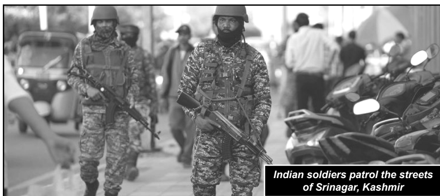
Indian soldiers patrol the streets of Srinagar, Kashmir

What feeds the insurgencies in both cases is the combination of extreme poverty and repression. And given the current aggravation of the economic crisis it's unlikely that this dire situation will improve any time soon.