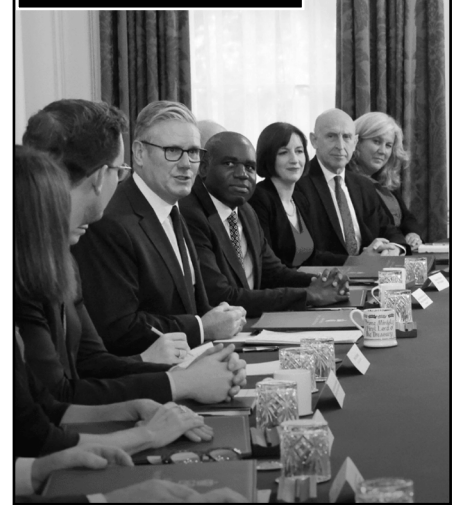
Starmer's shuffled cabinet