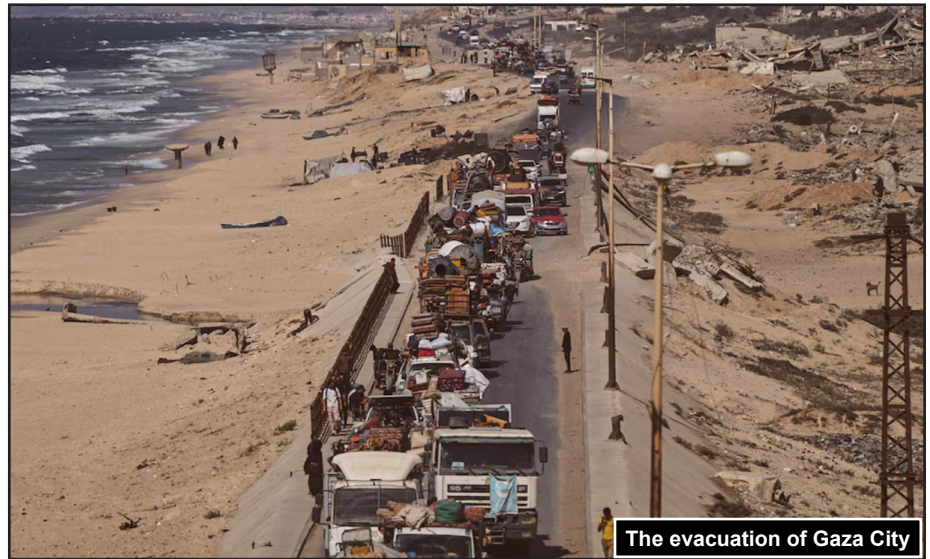
The evacuation of Gaza City

Netanyahu knows very well that Hamas cannot be defeated nor exterminated. He is just creating more resistance fighters throughout the Middle East - and everywhere else.