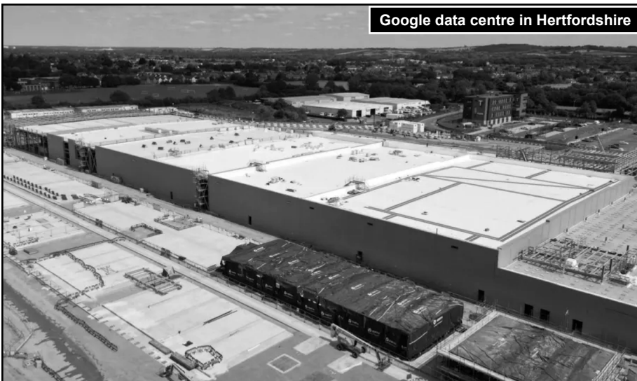
Google data centre in Hertfordshire

Today Britain's "data centre market" is already returning £4.6bn in profits and hi-tech investors (including Google and Microsoft) expect returns of £13.5bn/year within 5 years. Little wonder that these prospective new goldmines are like fortresses, surrounded by checkpoints, barbed-wire fences and alligator teeth!