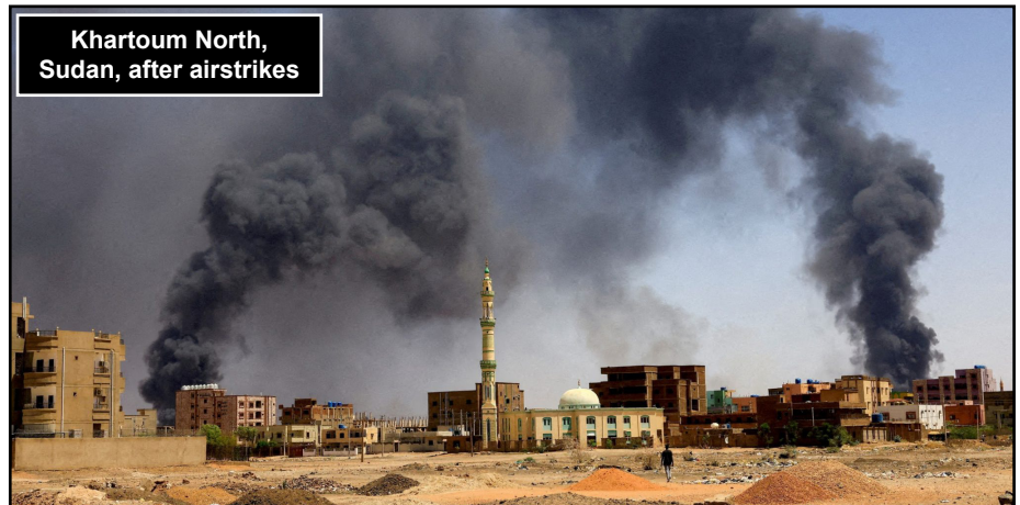
Khartoum North, Sudan, after airstrikes

In fact, the UAE and Egypt are among the top clients of Western arms industries. They are much too valuable pawns in the game the imperialist countries (especially the US) are playing in the region, to risk losing them.