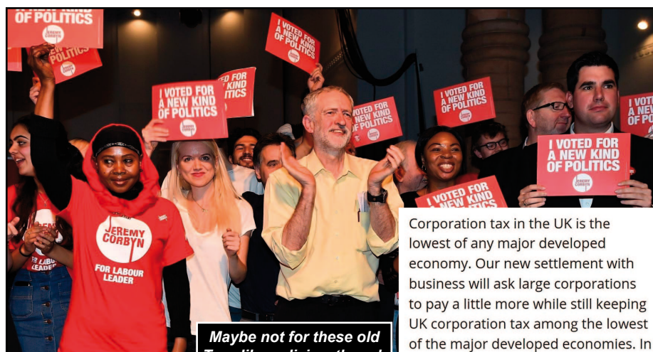
Maybe not for these old Tory-like policies, though

Corporation tax in the UK is the lowest of any major developed economy. Our new settlement with business will ask large corporations to pay a little more while still keeping UK corporation tax among the lowest of the major developed economies. In