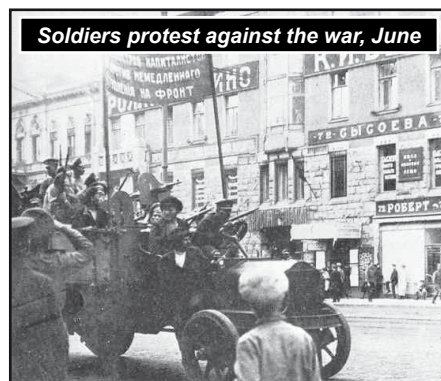
Soldiers protest against the war, June

"After all the preceding experience of the coalition, there would seem to be but one way out of the difficulty - to break with the Cadets and set up a Soviet government. The relative forces within the