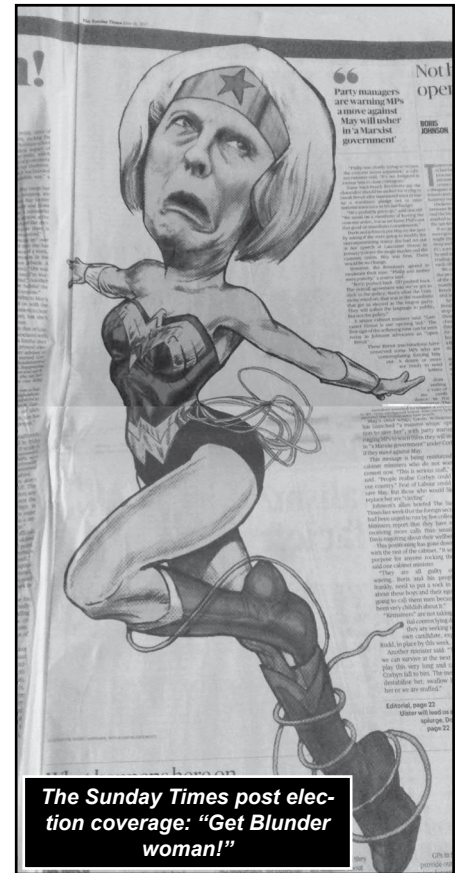
The Sunday Times post election coverage: "Get Blunder woman!"

Michael Gove, a prominent hard-Brexiter, was parachuted in as Environment secretary - causing outrage among environmental NGOs, given his climate change scepticism. Likewise, Steve