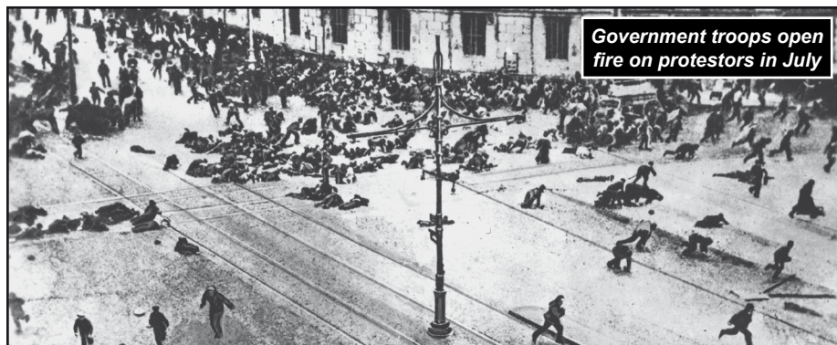
Government troops open fire on protestors in July

Having overthrown the Czarist regime in February 1917, the Russian revolution carried on developing. The Soviets, formed by elected deputies from working class districts, factories and army units, exercised the reality of state power. To deprive the working class of this power, the propertied classes, led by the capitalist Cadets party, formed a coalition government, with most of the anti-Czarist forces. They tried to restore the authority of the old state machinery, while striving to continue the imperialist war against which the anger of the working class had erupted in February.